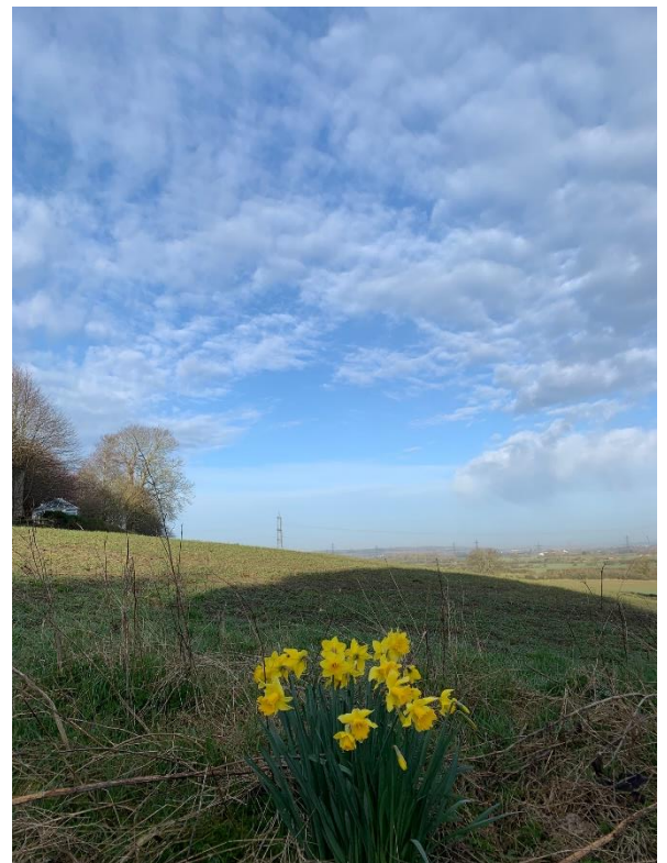
Above: Fiona Ardern